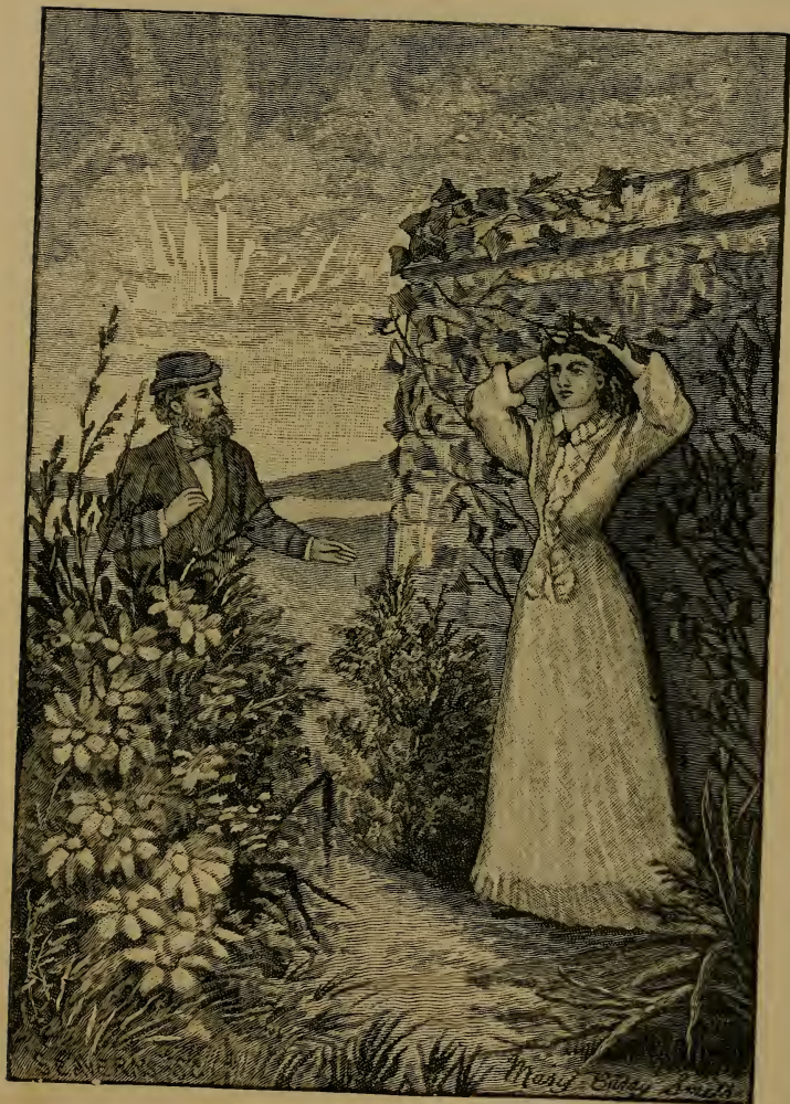
"I stood there fixed, My arms up, like the caryatid," — Page 42.